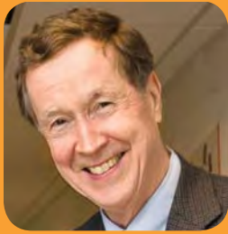
A message from the Executive Director

Instead of trying to control behavior through rewards and punishments, we help students internalize values and ways of thinking that lead to responsible behavior.