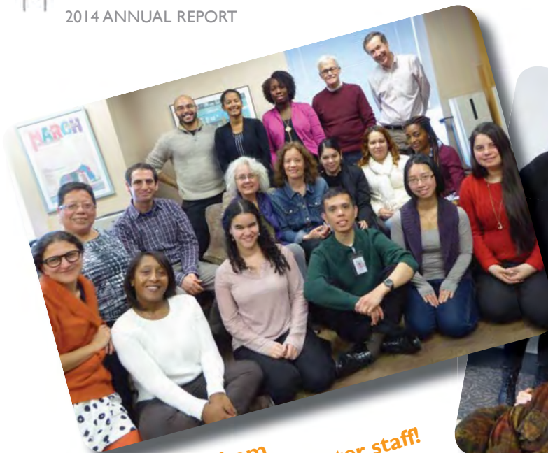
Hello from Morningside Center staff!