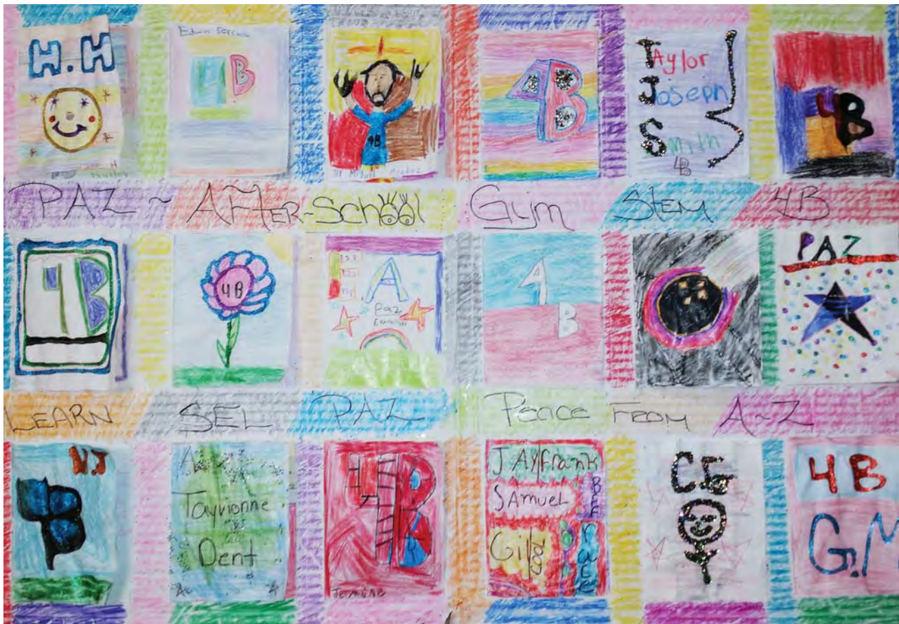
Below: A beautiful thank you card we got from 4th-graders at PAZ@214. Right: Two PAZ girls interview each other.